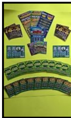
MEGA BUCK TREE