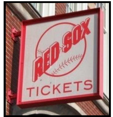
4 FIELD BOX SEATS WITH PARKING AND PRIVATE CLUB ACCESS