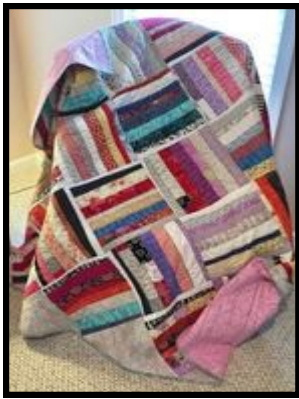
A QUILT OF MANY BEAUTIFUL COLORS SIGNED BY THE ARTIST

Here are examples of three great Golf Tournament auction items to bid for online. These are just a few of the many terrific items available...check out the Parish website for the link to these Auction items. GOOD LUCK IN YOUR BIDDING!