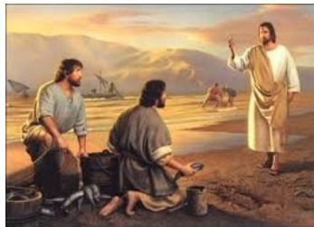
The call of Peter and Andrew