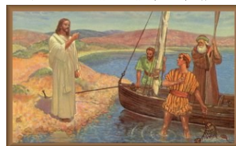
The call of James and John