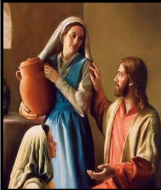
Jesus visits Martha and Mary Luke 10:38-42

JULY 17, 2016 SIXTEENTH SUNDAY IN ORDINARY TIME